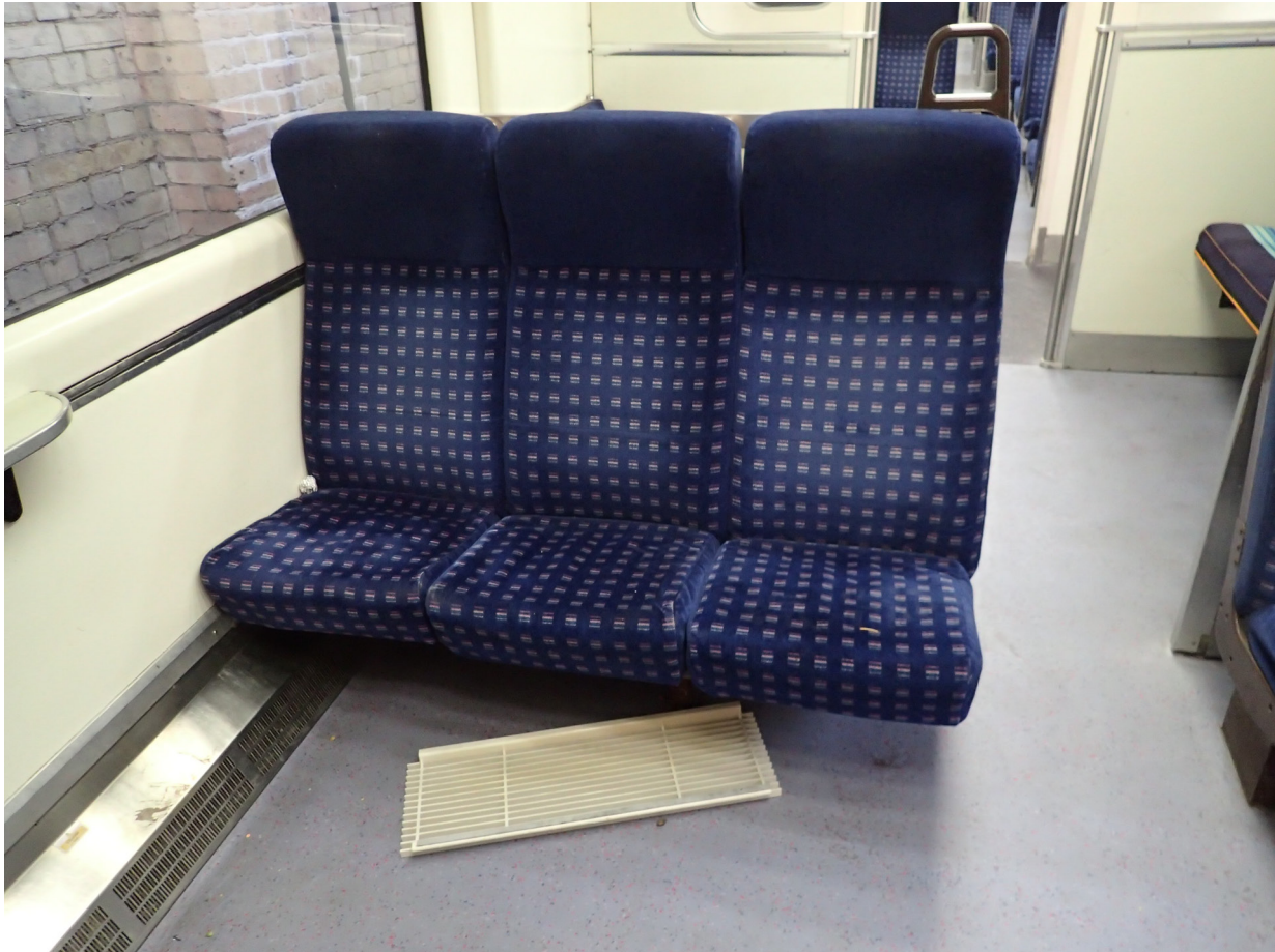
Figure 7: Diffuser on saloon floor following the accident