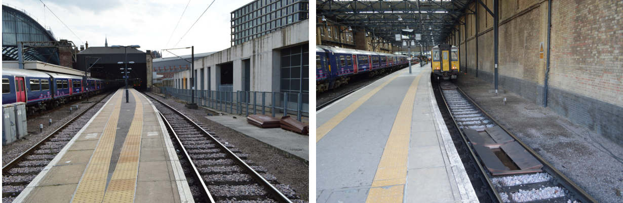
Figure 2: Platform 11 at King's Cross