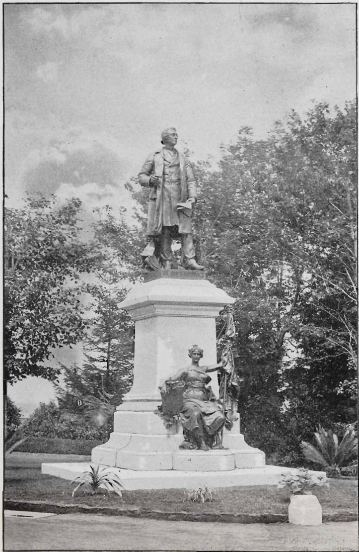
Monument to SIR JOHN A. MACDONALD.