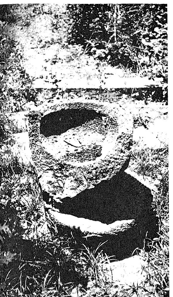
The holy water stoup found near the ruins of the Church of St. Paul in Ayuthya