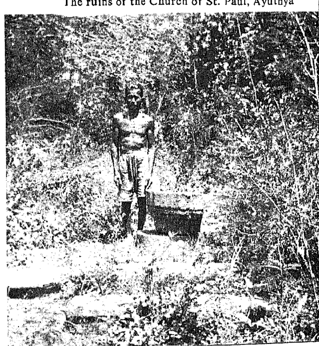
The ruins of the Church of St. Paul, Ayuthya