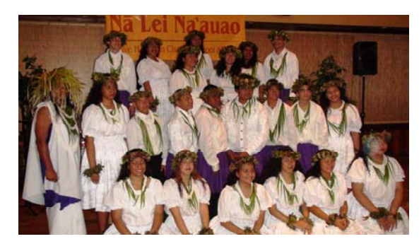
KANAKA Haumana at Kui Ka Lono

K-3 (2000) now K-1(2013) Reading, writing, math, science, and phonics Place/Projects based Hawaiian studies 4-7 (2000) now 2-5 (2013) Reading, writing, math, science, and typing programs Place/Projects based Hawaiian studies 8-12 (2000) now 6-8 (2013) Common Core standards emphasis, Place/Projects based Hawaiian studies Now 9-12 (2013) Common Core standards emphasis, College Prep