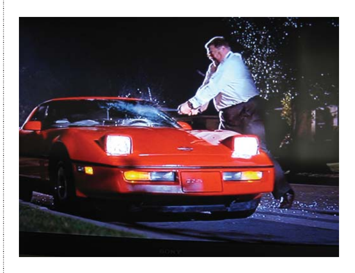
Fig. 5. 'This is what happens ....

Lamenting the violence done to the original print, a critic would dismiss this cut outright. Yet, The Big Lebowski's censored print has been integral to its reception. On the one hand, it offers its own pleasures.