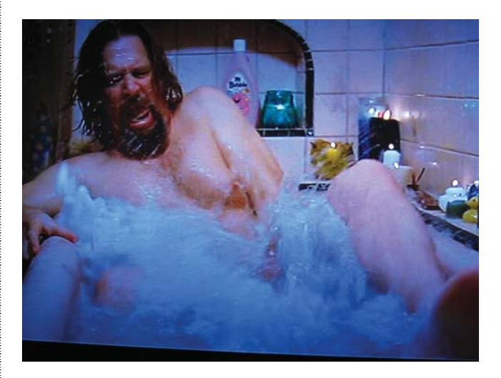
Fig. 8. ... and chaos ensues.

As cult is a metagenre that can encompass a spectrum of film genres, replay culture, as it incessantly circulates cult, reveals the significance of these 'subgenres' to circulation and consumption. Just as the midnight movie, via programming that associates The Big Lebowski with Rocky Horror, defines the film overtly as cult, Comedy Central situates the Coens' title in relation to media that emphasize other generic affinities frequently allied with cult, namely 'slacker' and 'stoner' variants of comedy. Showing The Big Lebowski in the company of Office Space and Old School helps to classify it as part of the slacker oeuvre, one that features male characters repudiating the work ethic in various ways. Given the Dude's happy state of unemployment and lifestyle focused on bowling with the boys, the Coens' film falls easily into this category. With its former connection to Chappelle, Comedy Central has also featured his film Half Baked and sold it online. A DVD two-pack of both films suggests that the Coens' title is kin to the stoner comedy, another kind of male-oriented farce often fused with the slacker film (such as