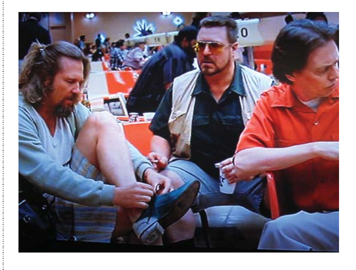
Fig. 1. The Dude (Jeff Bridges), Walter (John Goodman) and Donnie (Steve Buscemi) at the bowling alley. All images from The Big Lebowski (Joel and Ethan Coen. 1998).

The filmmakers' reputation, their revision of Raymond Chandler's noir universe, and the film's star cast were not enough to keep The Big Lebowski 's theatrical premiere from being a letdown, but it thereafter gained a significant second life. It appeared in staggered rereleases in the US home market, including reissues on laser disc and DVD in 1998, on VHS and DVD in 1999, and on cable and satellite channel USA beginning in 2000. Showings on cable and satellite channel Comedy Central followed, as well as a 2002 DVD and a 2003 DVD two-pack of The Big Lebowski and Half-Baked (Tamra Davis, 1998), a stoner film