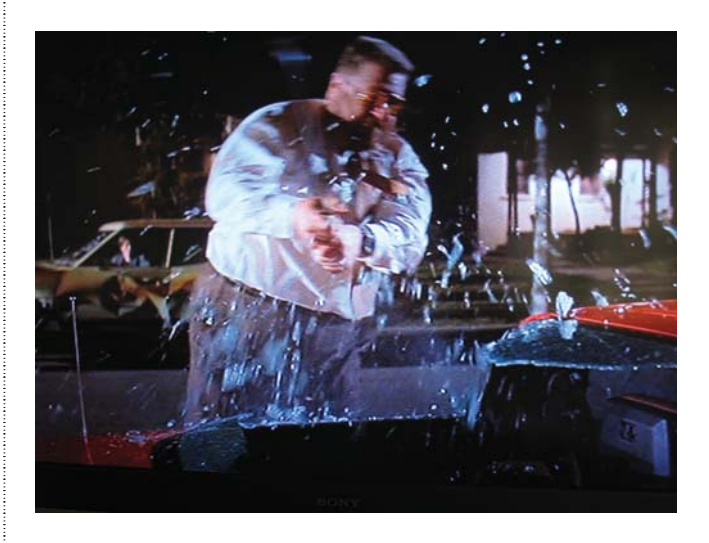
Fig. 6. . . . when you fuck a stranger in the ass.'

Although other significant demographics purchase DVDs, studio executives have remarked that 'DVDs are a man's world', with men comprising the main audience for films that do particularly well in this