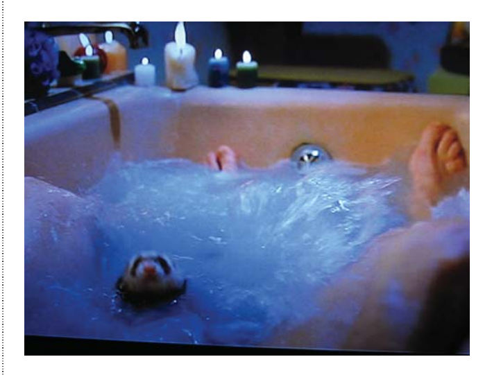
Fig. 7. Surreal humour: the marmot lands in the Dude's bathtub ...

Comedy Central has offered such fare as South Park , The Daily Show , The Dave Chappelle Show and The Man Show , generally attracting a demographic that is 64% male and 36% female, with a median age of thirty. The channel is also the number-one network in primetime among men aged eighteen to thirty-four and number two among men aged