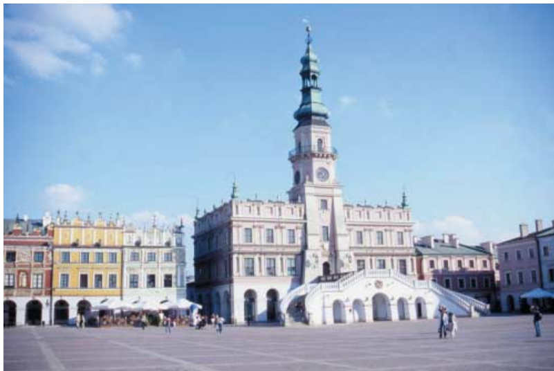
Figure 2. Zamosc, pictured in 1992.

connected to the amalgamation of the European Union. The recent designation or proposal of a number of transnational sites, such as the Roman frontier fortifications, the Franco-Belgian belfries and the Struve Geodetic Arc (a chain of nineteenth century survey triangulations stretching from Hammerfest in Norway to the Black Sea, through ten countries and over 2,820 km) show this tendency.