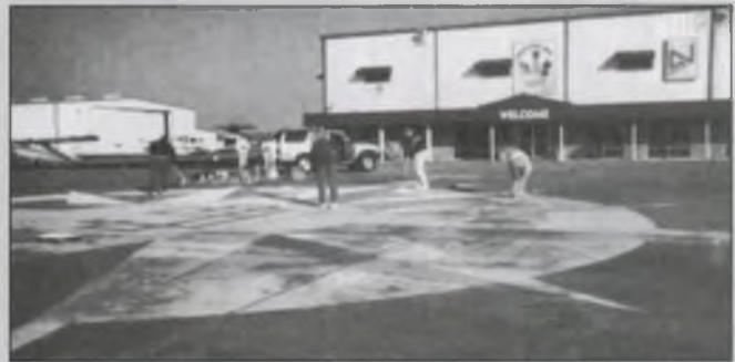
The compass rose at IWS goes from dirty to dazzling thanks to Houston members, their families and student pilots.

November saw some of our chapter members assisting at a Challenge Air event at Weiser Airpark, and then the Houston 99s had an information table at the Young Eagles event the same day at West Houston Airport. The following weekend brought several chapter members, spouses and student pilots to repaint the compass rose at IWS in time for Christmas and January's Super Bowl in Houston. Compass rose repainting was also done in early January at Houston Southwest Airport.