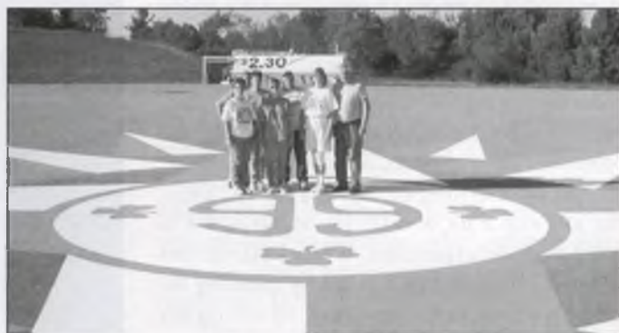
Members of the Michigan Chapter 99s and the Clare Area Pilots Association create a compass rose at Clare Municipal Airport.