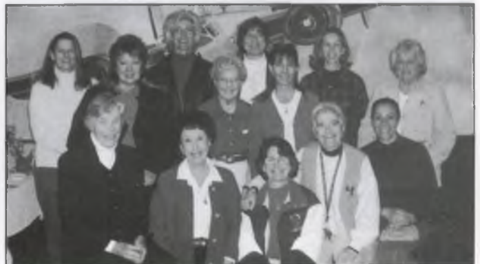
Tucson Chapter Members enjoy lunch at Anzio Landing restaurant on Falcon Field in Mesa.