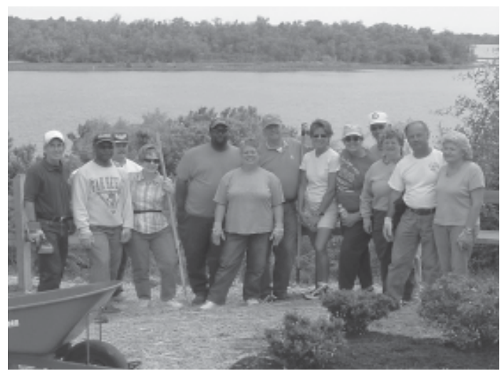
Volunteers at Evergreen project

FOLAR and its members have proven they can get the job done! Its credibility has been rewarded with significant grants and donations to move forward on their goals. These have come from NiSource (Columbia Gas), Waste Management, City of Hopewell, Dominion Resources, John Randolph Foundation, the Virginia Department of Conservation and Recreation and others. FOLAR thanks all its members, volunteers and sponsors for their continued support of the organization and we wish all the very best as the year draws to a close.