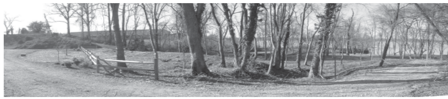
Panoramic view of Patrick Copeland School site