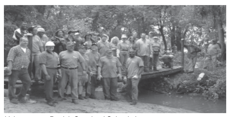
Volunteers at Patrick Copeland School site