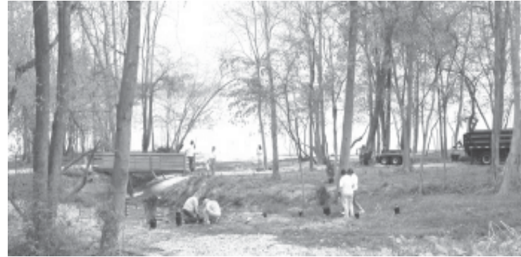
Tree planting at Patrick Copeland School site